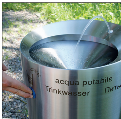
Enjoy fresh water at the touch of a button.

The Fontana drinking fountain fits into the product range of designer and inventor Werner Zemp. It thus