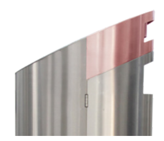
The ashtray is located in the top part of the Littershark. The Littershark can be equipped with an ashtray emptying flap or a pull-out ashtray.

Waste and ash disposal in one: all our Littersharks, which are available in sizes ranging from 35 to 220 litres, can be fitted with an ashtray. For quick, effortless and contact-free emptying, all of our standard Littershark models have an ashtray with emptying flap that, thanks to its spring hinges, makes cigarette butts and ash disappear into the bag or bin in an instant. The ashtray and emptying flap can be cleaned easily and efficiently, and thanks to the large capacity of our Littersharks, requires far less frequent emptying.