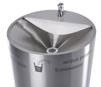
The integrated drainage sieve prevents blockages.