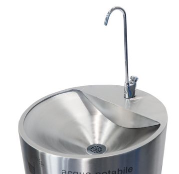
Rotatable tap neck for filling water bottles (recommended for indoor or sheltered locations)